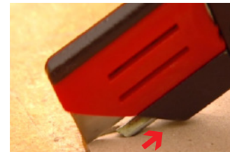
2. Spring loaded pin guard will auto retract and protects blade edge when you are cutting. This prevents blade loses contact with the cutting surface.